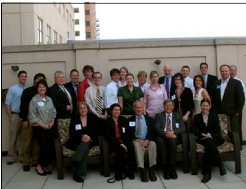
WPA Legislative Advocacy Day Participants.